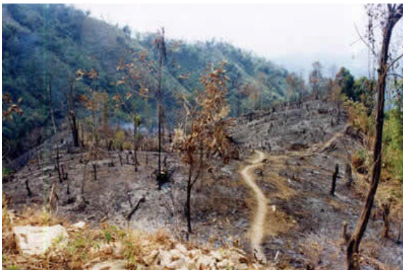
Figure 3: Hills under 'jhum'