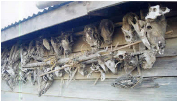
Figure 4: Skulls of hunted animals on display

Slash and burn or shifting cultivation (Figure 3), locally called 'jhum' and hunting (Figure 4) are the two principle threats to primates in Mizoram. Mizoram is a land of traditional hunters and 'jhum' cultivation and because of this, the forests are always under threat. During the surveys the rough boundaries of Protected Areas, etched as forest extents on otherwise bare and 'jhumed' hills could be identified. Wildlife is thus somewhat confined to PAs in Mizoram inside which 'jhum' and hunting are prohibited and these areas are probably one of the only places in which wildlife can be conserved in this state. However, 'jhum' cycles of 15-20 years create successional forests, which may be able to support species such as Phayre's leaf monkey (Gupta and Kumar, 1993).